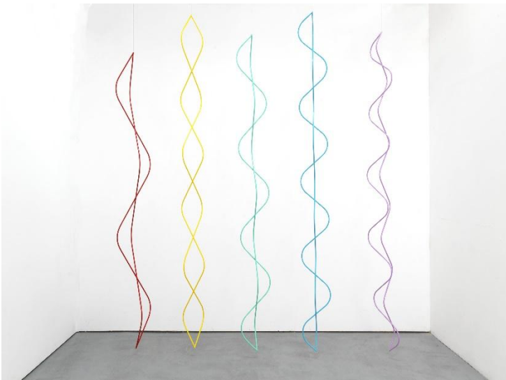
Magnetic Wave 2022 Stainless steel tubing, 2022 Red 267cm, Yellow 300cm, Green 300cm, Blue 300cm, Violet 286cm